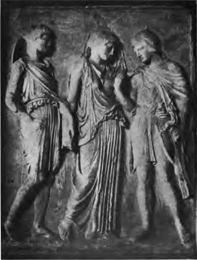
Fig. 59. Parting of Orpheus and Eurydice.